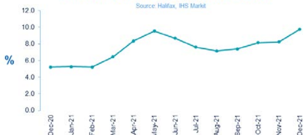
Halifax HPI: Average house price